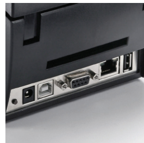
Ethernet, USB 2.0, Serial and USB host are standard features adding flexibility and power